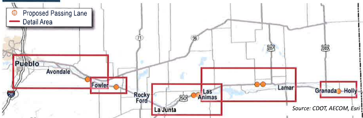
FIGURE 1 US 50 SHIFT PROJECT – LOCATION OF PROPOSED PASSING LANES

The first two proposed passing lanes are located in the Pueblo to Fowler segment of the US 50 High Plains Freight corridor. Given its origin in Pueblo, this segment has the highest average daily traffic (ADT) of any of the segments, ranging from 4,500 to 18,000, with more than 10% of the traffic comprising commercial trucks and a following rate of more than 35%. This segment also has the most accidents of any segment, with three fatalities and nearly ninety injuries recorded between 2015 and 2020. One eastbound and one westbound passing lane are proposed for installation, just to the west of the town of Fowler, though still within the County of Pueblo.