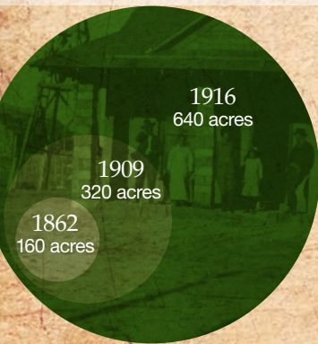
Acres allowed per homesteader

establish a successful farm in states like Iowa, more land was needed in the drier lands of the West. The Enlarged Homestead Act of 1909 increased the number of acres per homesteader to 320 in areas where irrigation was not possible. Seven years later, the Stock Raising Act of 1916 allowed homesteaders to claim 640 acres on lands determined suitable only for grazing. Today, cattle ranching continues to be the predominant use of land in the area.