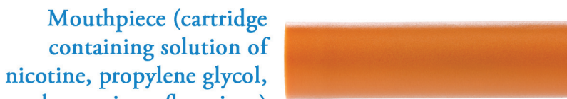
Mouthpiece (cartridge containing solution of nicotine, propylene glycol, and sometimes flavorings)